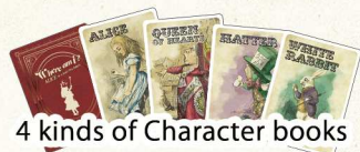
4 kinds of Character books