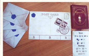
* Each player's setup