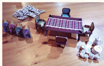
* Table setup